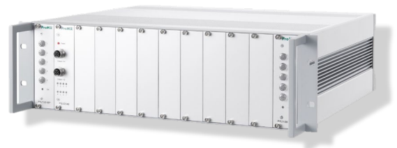
PSU2048 19" rack Integration

The PSU2048-R is a standard 7BU unit for a 19" ProMik Rack.